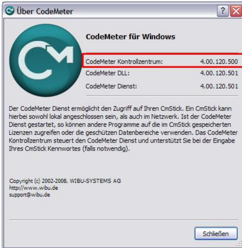
Screenshot CODEMETER control center , latest driver version 4.00